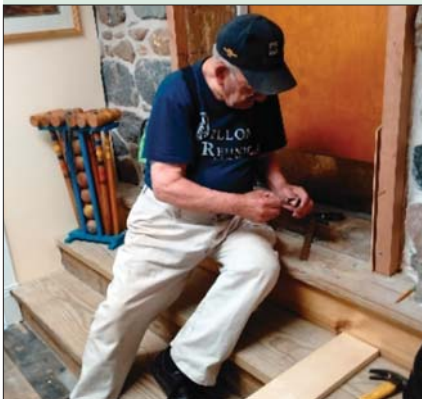
Replacing backdoor trim