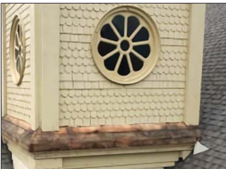
Steeple Ledge Before Repair

We continue to need your help to meet this challenge and prepare for the new emergency that has arisen. See below. Please use the donation form on page 7 to make your contribution to this important project.