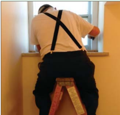
Repairing window trim