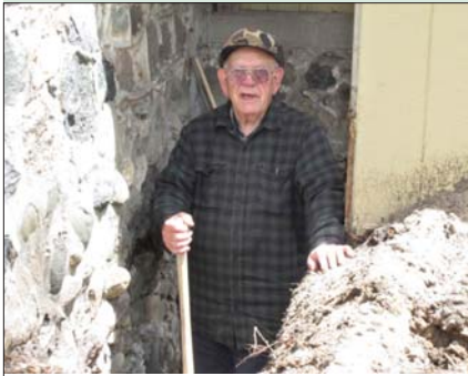
Putting in drainage tiles